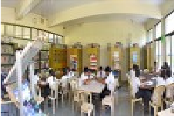
SCIENCE LAB PHOTO